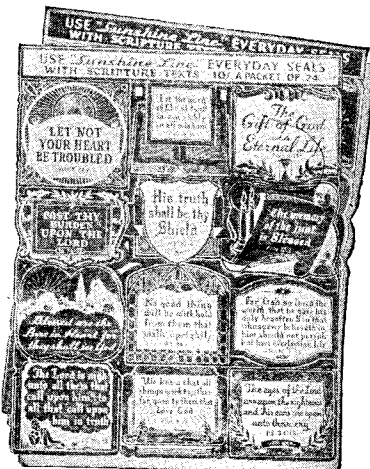
SCRIPTURE TEXT SEALS